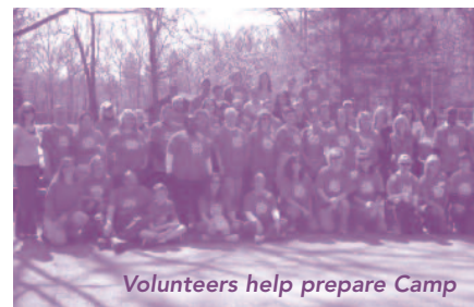
Volunteers help prepare Camp

S pring is always an especially busy time at Camp Cheerful getting ready for the over 1,500 anticipated campers. After a long winter, there is much work to be done. Thankfully, the Achievement Centers for Children hosts several volunteer groups each year to complete the numerous tasks to get Camp ready. Last April, with the help of Business Volunteers Unlimited, we hosted over 50 employees from the Cleveland Clinic and the Cleveland Indians for Global Youth Service Day. They completed a variety of tasks including cleaning cabins, painting, landscaping and more. Thank you to each volunteer for making a difference for our campers!