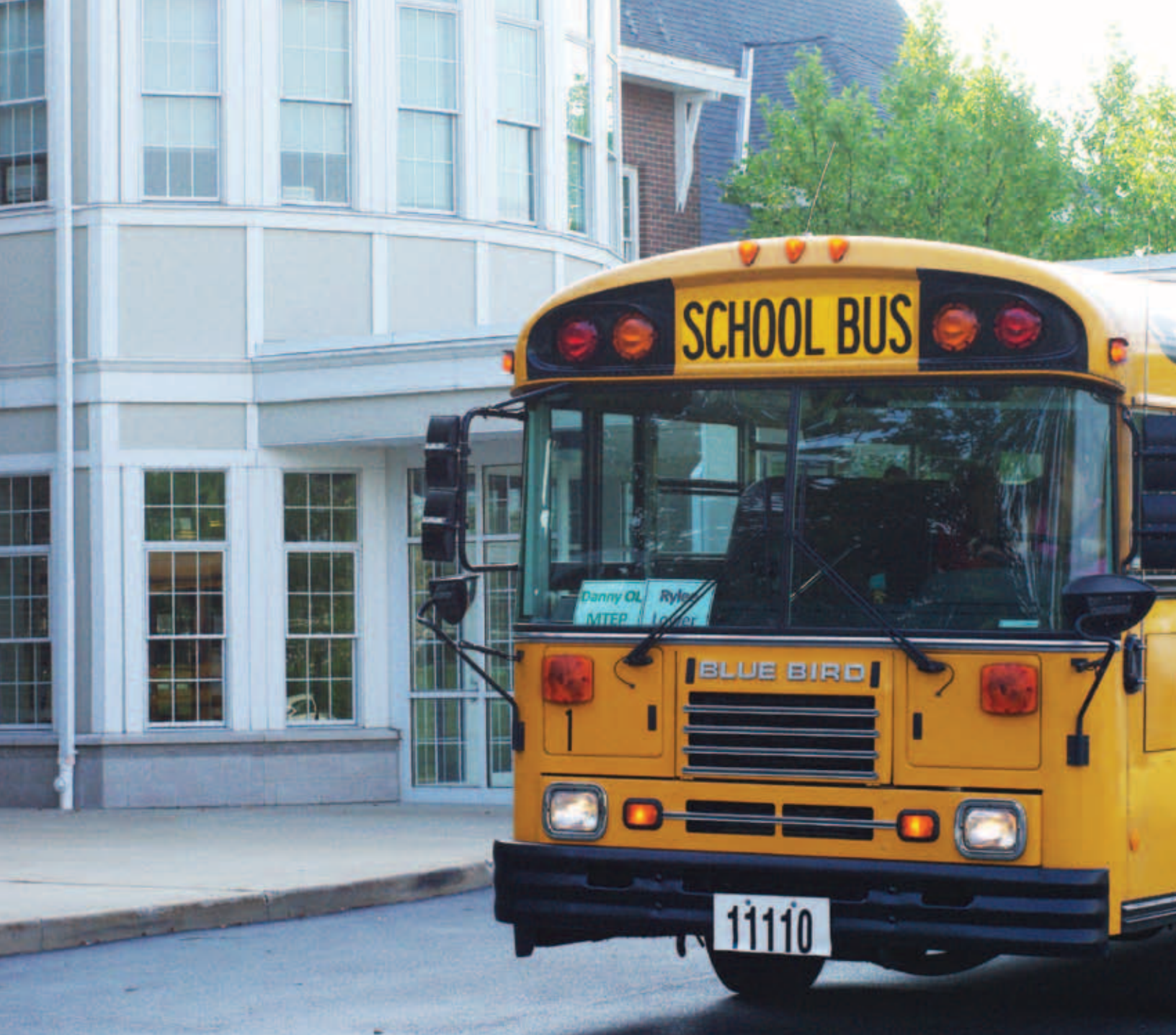
Cover photo: Child Development Center celebrating "Iuau day" This page photo: Highland Hills location

This year, the Achievement Centers for Children proudly celebrates 70 years of serving children with disabilities and their families. It all began when a group of community-minded members of the Rotary Club of Cleveland formed the Society for Crippled Children to serve the needs of children with polio and heart disorders. Today, we serve families dealing with a spectrum of disabilities, including an increasing number of children with autism. And we remain uniquely qualified to provide a circle of care to families through therapy, recreation, education and family support.